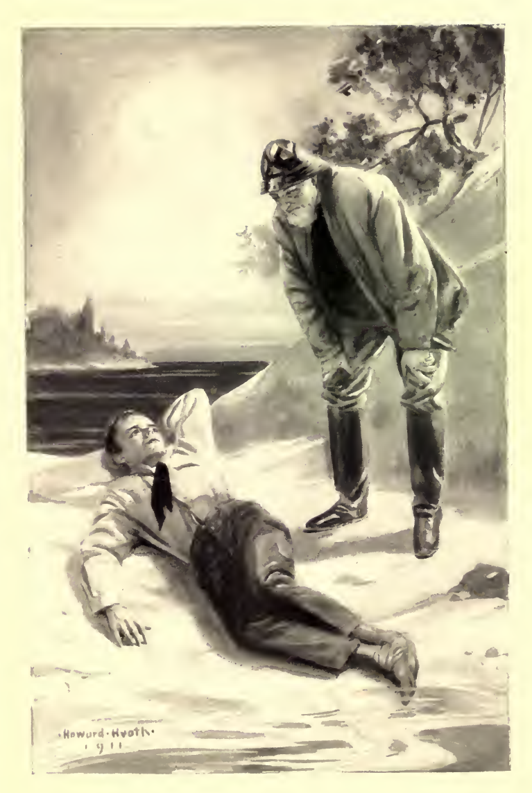
"'Gosh!' repeated Seth. . . . 'Jiminy crimps! I feel better.'"